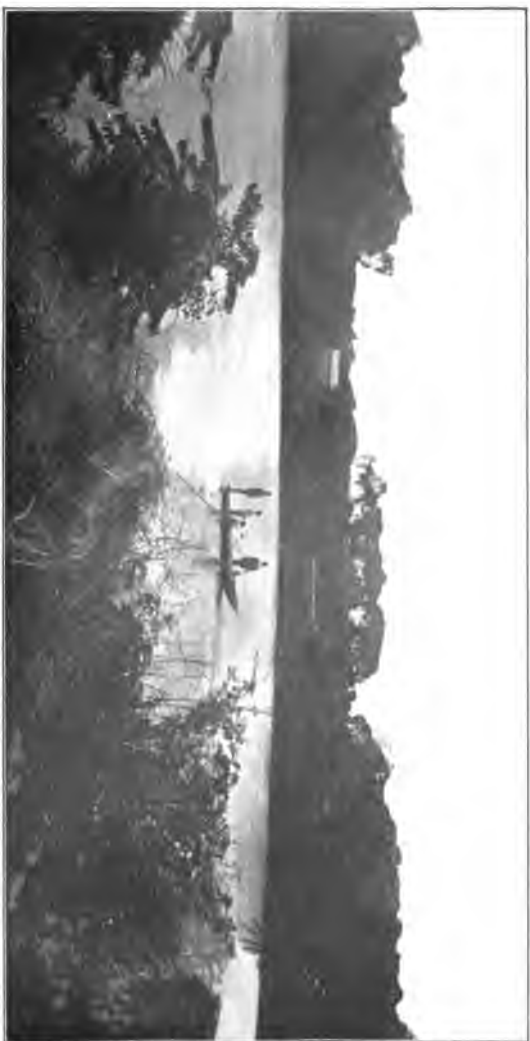
View of the lagoon (near the Scheffelin Mission Station), at the mouth of which Jacob Kenoly met death. The School Building is seen in the distance.